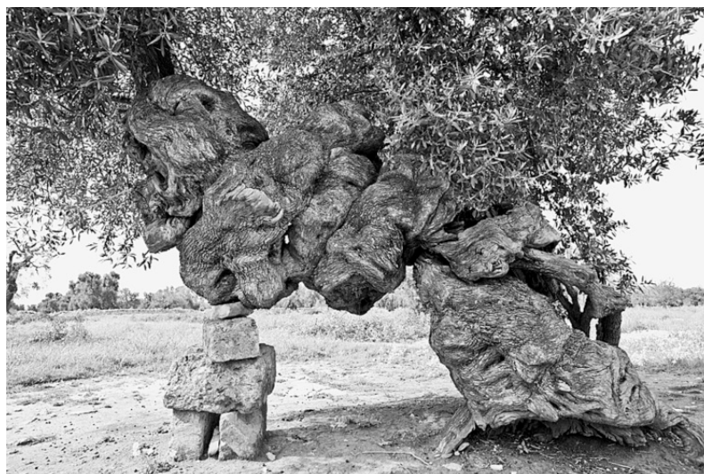
Picture 4: Century-old olive trees, Dune Costiere, Italy

Monte Rufeno (Italy) is a great example of local cooperation allowing stakeholders to work with the community for conservation, education, sustainability and public awareness. MEET eco-tourist package helps participants to achieve conservation goals by undertaking simple environmental monitoring activities inside the PA, which have a direct positive impact on the conservation of the reserve, and additionally create emotional links and a heightened appreciation for nature among the guests. Compounding these positive benefits there are the financial contributions sourced from their participation.