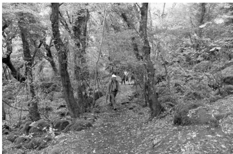
Picture 3: Hiking in the Sasseto Woods, Monte Rufeno, Italy.

Monte Rufeno (Italy) is a great example of local cooperation allowing stakeholders to work with the community for conservation, education, sustainability and public awareness. MEET eco-tourist package helps participants to achieve conservation goals by undertaking simple environmental monitoring activities inside the PA, which have a direct positive impact on the conservation of the reserve, and additionally create emotional links and a heightened appreciation for nature among the guests. Compounding these positive benefits there are the financial contributions sourced from their participation.