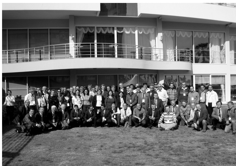
Picture 1: The participants of the 1 st Mediterranean Forest Week at Antalya

The International Association for Mediterranean Forests ( AIFM ), established in 1996, gathers people from nearly all the Mediterranean countries in order to develop shared vision and pilot experiments on the sustainable management of forests, woodlands and other natural areas. The AIFM is developing a network of collaborations. Among others, the AIFM has led the project “Problems of the Mediterranean forest” (2000-2002, Interreg IIC) that generated the Declaration of Marseilles. Then, this NGO is disseminating knowledge and results of shared initiatives within the Mediterranean, facilitating exchanges and fostering advocacy on regional, national, European and Mediterranean levels.